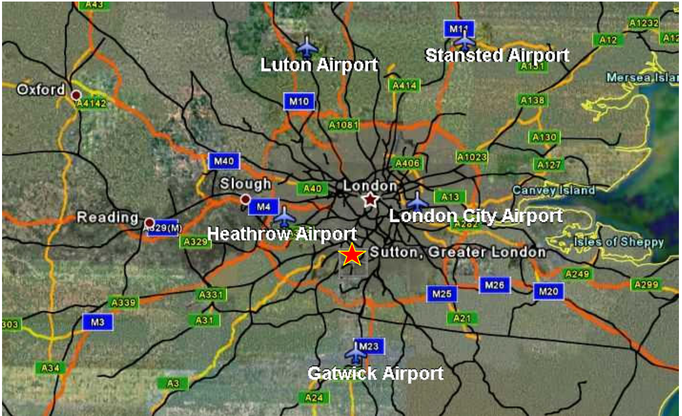
Fig. 1: General location showing airports